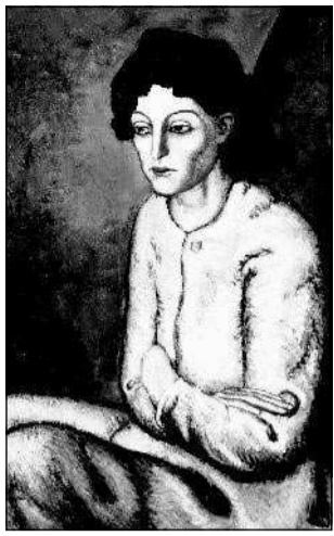
"Femme aux Bras Croisés" sold for $55 million yesterday, tops for a Picasso.